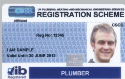
New UK-PHMES Registration Scheme Card

As from 2nd February 2009 , a new UK-PHMES CSCS Registration Scheme Card will be introduced to reflect the formation of the UK Plumbing, Heating & Mechanical Engineering Services CSCS affiliated Registration Scheme. Examples of the new and the existing card designs are shown below: