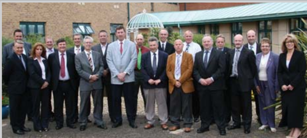
Representatives of the two Plumbing Joint Industry Boards and Unite the Union at the launch of the UK Plumbing, Heating & Mechanical Engineering Services Registration Scheme

Both Joint Industry Boards are committed to improving the levels of competence and professionalism of craft operatives and apprentices working in the plumbing, heating and mechanical engineering services Industries.